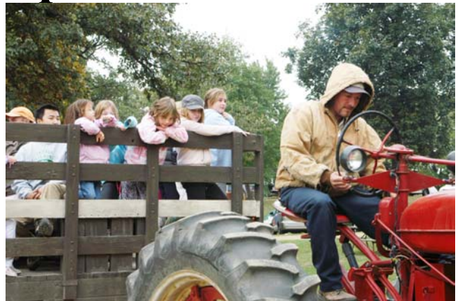
Princesses on Hay Ride