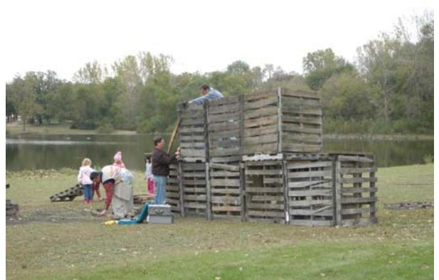
The Bonfire takes shape