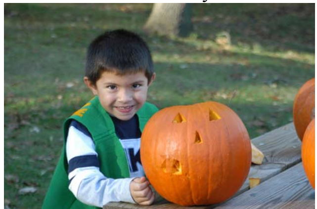
See the resemblance?