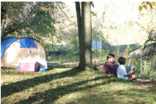
Father and Son