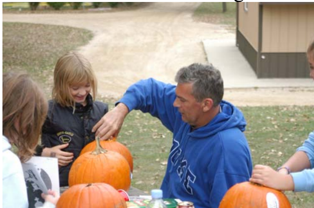
Dad gets the icky work